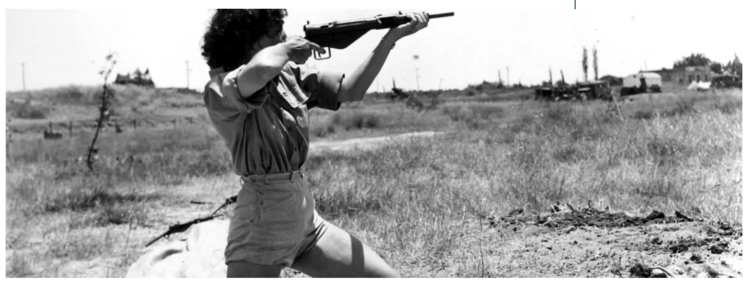
A female Israeli officer giving a demonstration at a Women's Corps camp near Tel Aviv on how to handle a Sten gun, June 1948.