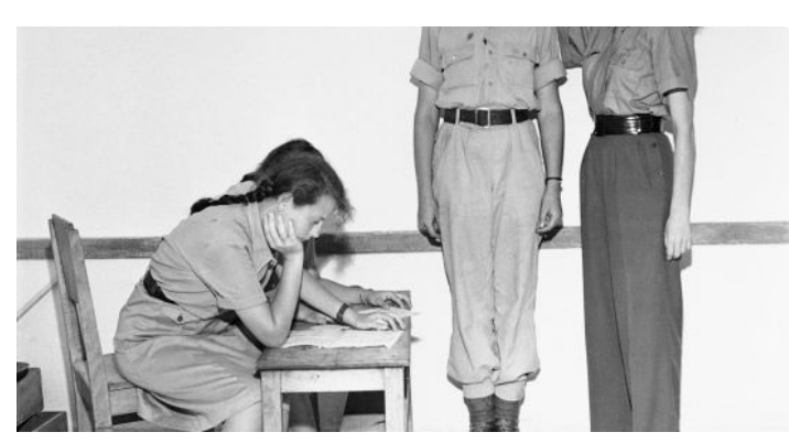
Members of the women's division of the Stern Gang are given physical examinations before induction into the Israeli army, June 1948.

Compared to Europe and the United States, progress toward a greater female presence in the political arena has been unusually slow. But the tide is turning. Today, for the first time, more than a quarter of Israeli lawmakers are female. And this is despite the fact that ultra-Orthodox political parties refuse to allow women to serve in their ranks.